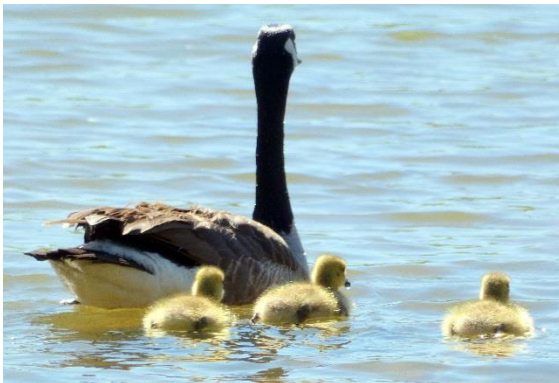
Mother Goose and babies are doing fine.

Lots migratory birds are enjoying the Grove pond as they pass through the area. Residents can see various wild life around the pond and natural trail.