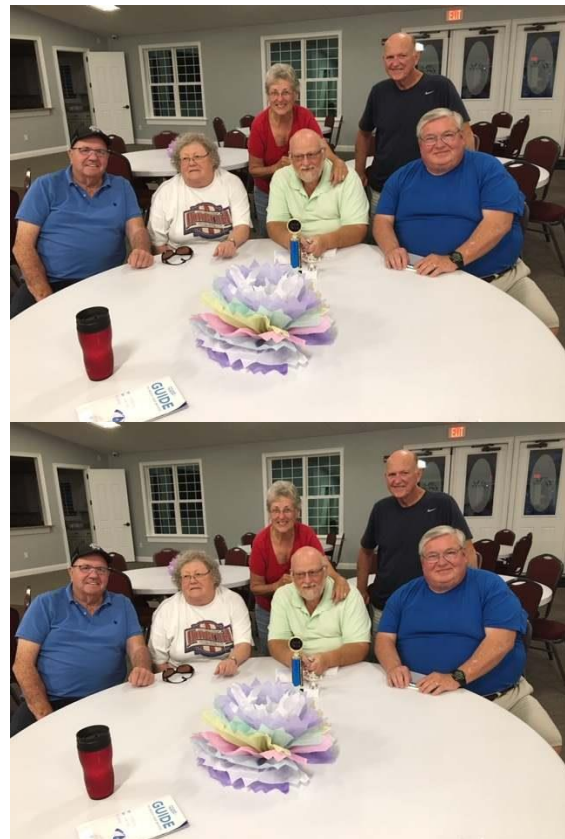
Pictured are the winning and losing teams from out last trivia night.