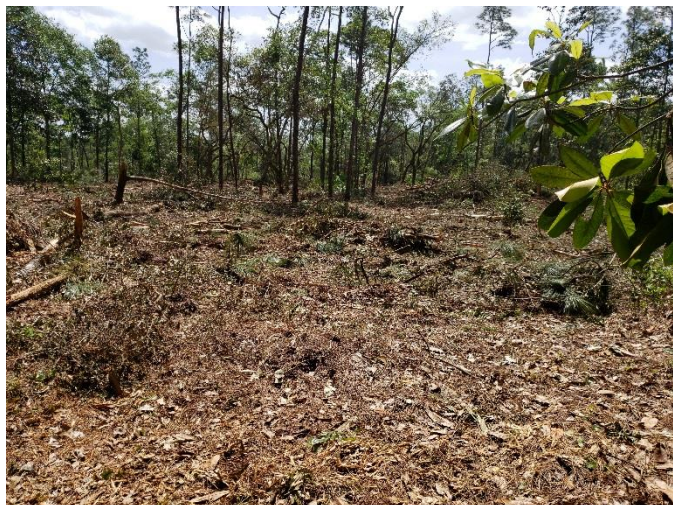
Clearing out to make a road to haul out downed trees