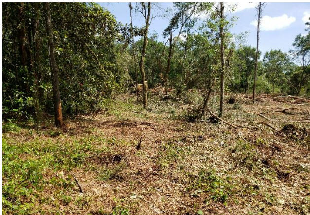
15 feet east off the natural trail behind Pondview Drive

The loggers showed up on Monday, April 22 to start harvesting the pines and hardwood trees. Squirrels, snakes, birds and mice are on the run looking for new places to settle. Here are some pictures after one week of work.