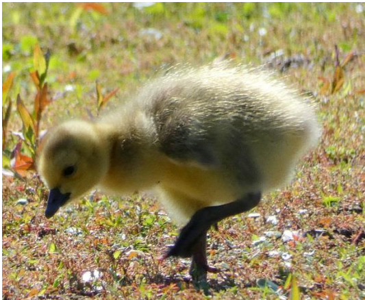
A Blessed Event at the Pond